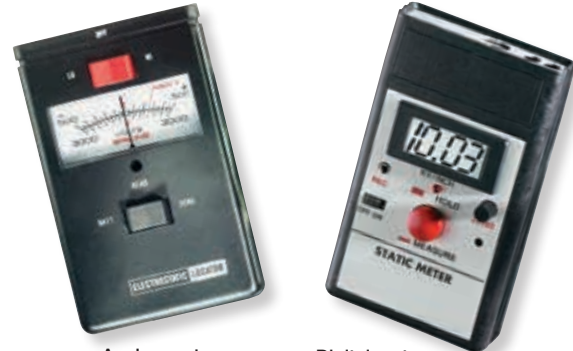
Analog meter 17797-30

– Measure the magnitude and polarity of electrostatic fields produced by charged objects