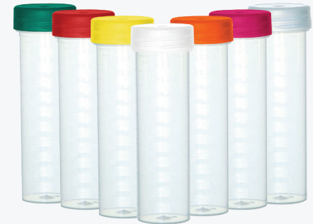
Certi Digestion Tubes